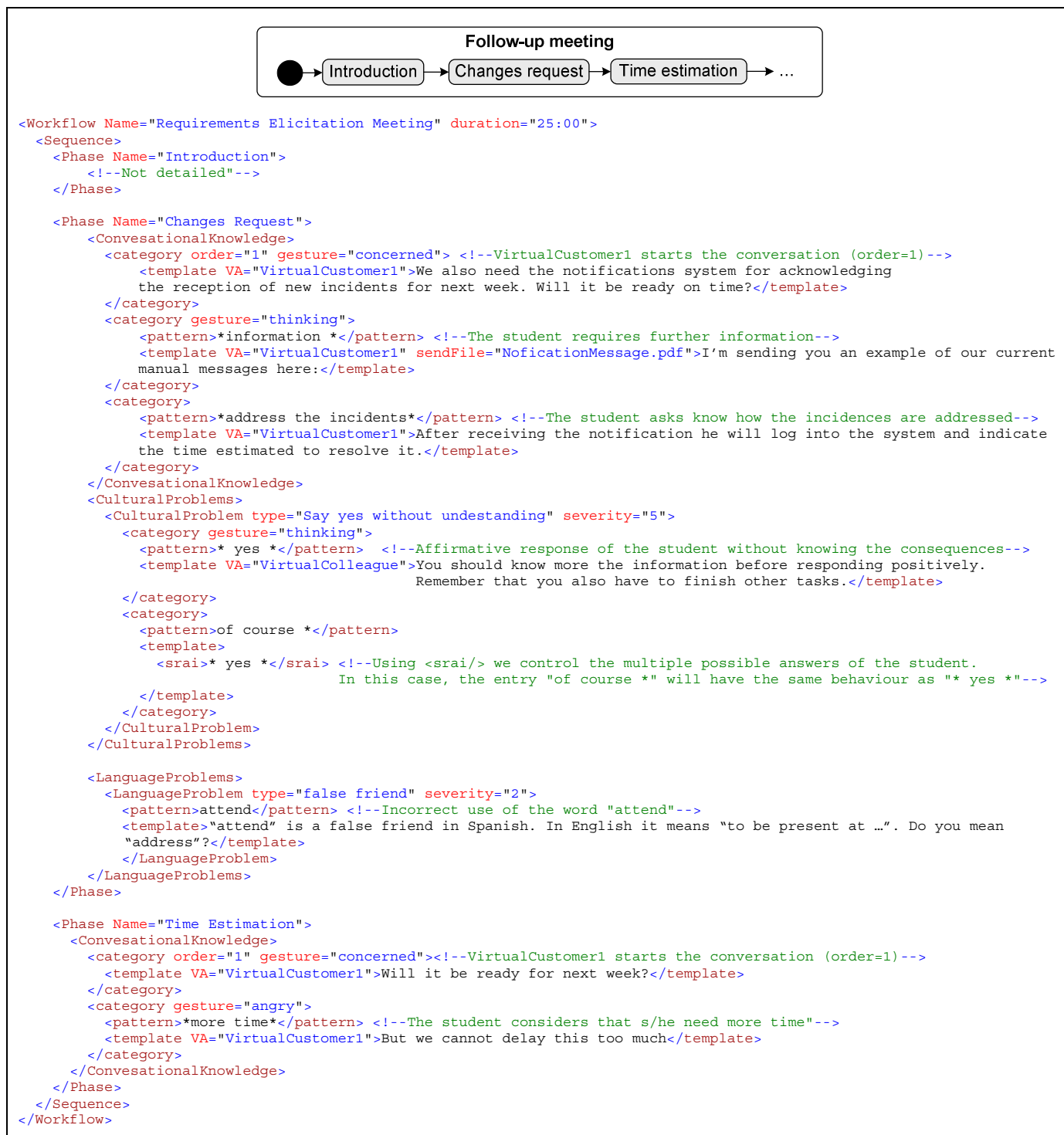
Figure 3. Example of an VTRML-based sequential workflow definition.

For the definition of this XML-based workflow, we have considered the indications of Clear et al. [35], in which the structure of a meeting in international collaborative settings is described.