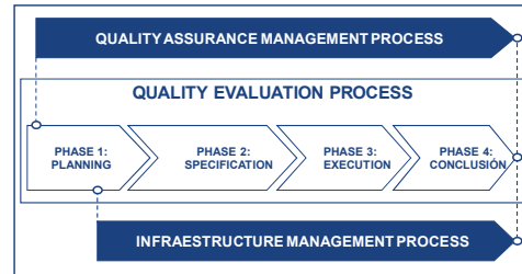
Figure 2: Processes of the IPavement Methodology.

In carrying out this adaptation, a remodelling of the Assessment Methodology has been undertaken. This has led to the IPavement Methodology being composed of three processes, rather than of one single process, as in the Methodology of AQC Lab. This may be observed in Figure 2.